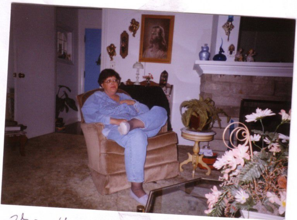
270 lbs 2003