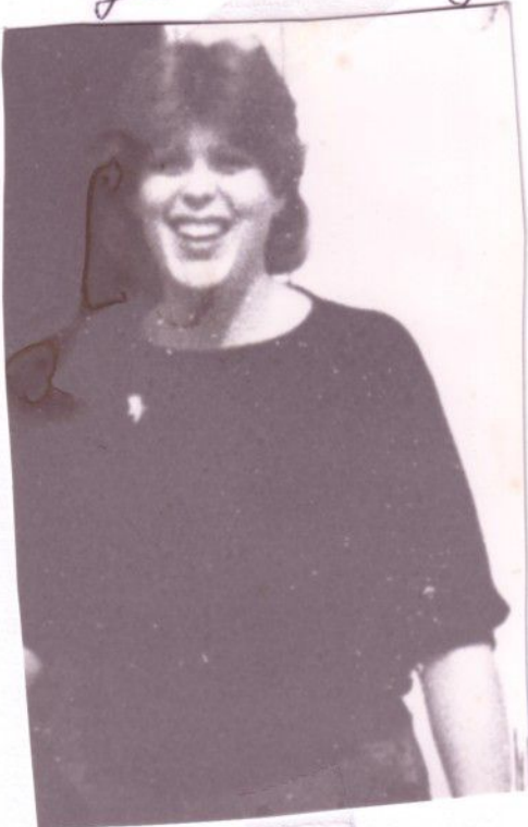
at docs WHS Clinic 1984